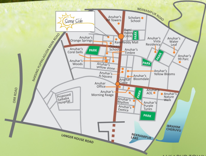
ALKAPUR TOWNSHIP LAYOUT (not to scale)

There is nothing like the feeling of belonging. In an independently styled residential retreat tucked away in the sylvan setting of Alkapur Township - a close-knit community that radiates positive energy. Lined with an array of verdant parks and adorned with colourful habitats. A world within. Where you can shine in your own private abode of style, elegance and exclusivity. Welcome to Sunny Side.